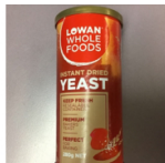
Water + yeast